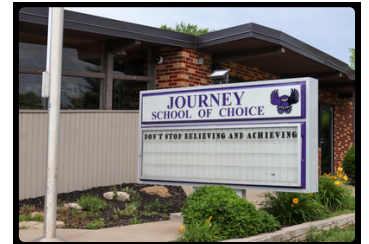
JOURNEY SCHOOL OF CHOICE