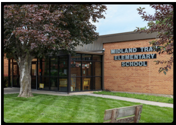
MIDLAND TRAIL ELEMENTARY