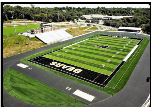
TURNER DISTRICT ACTIVITES CENTER