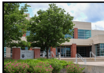
TURNER HIGH SCHOOL