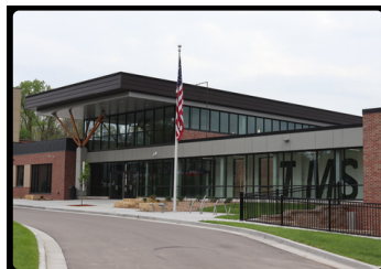
TURNER MIDDLE SCHOOL