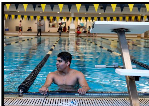
TURNER AQUATICS CENTER