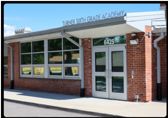
TURNER SIXTH GRADE ACADEMY