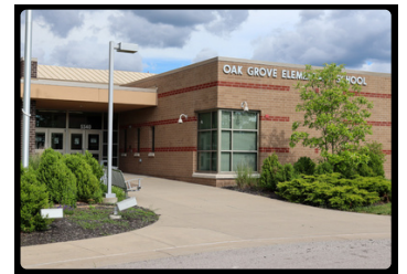
OAK GROVE ELEMENTARY